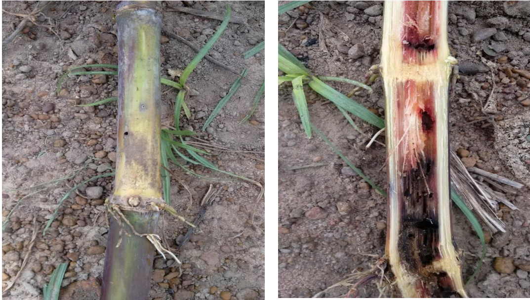
A: cane stalk bored